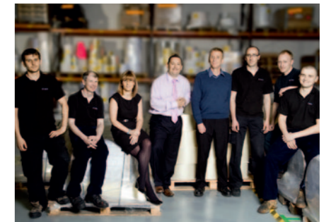
AC Labels won back ISO 9001 certification thanks to the total commitment of the whole team.

Garry Lambert is a British freelance journalist based in Switzerland.